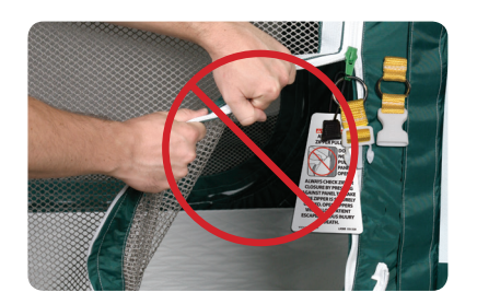
NEVER rip the panels open, as this will damage the zipper slider, preventing the zipper from closing completely.