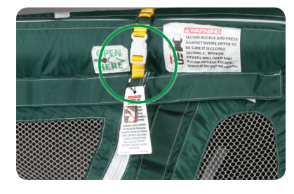
Snap the quick-release buckles shut to make sure all zippers are completely closed, and check by tugging on each buckle.