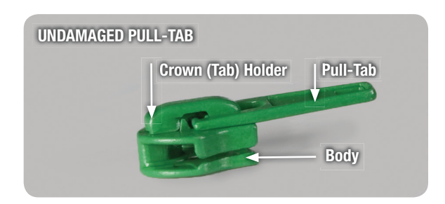
ALWAYS use the zipper pull-tabs to open and close zippers and ensure that zippers are fully closed.

To request a Posey Catalog or speak with an associate, call 1.800.44.POSEY (76739) or visit us online at Posey.com