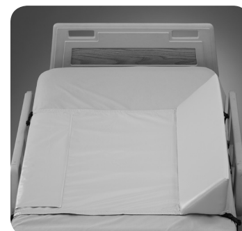
5718SC - Vinyl