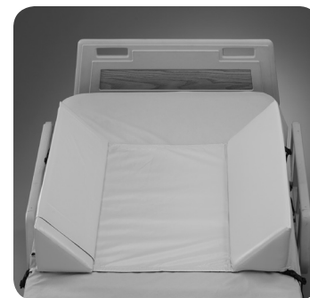
5716SC - Vinyl