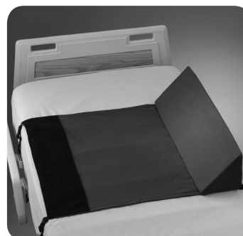
5718 - Brushed Polyester