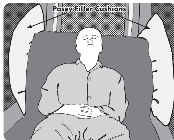
Proper placement of Posey Filler Cushions