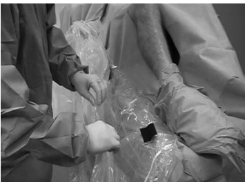
Step 7: Adhere to Patient Drape above Sterile Field Line