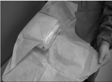
Step 2: Remove CSR Wrap