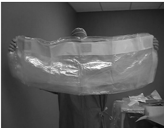
Step 3: Unfold Drape