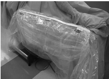
Step 8: C-Armor is now ready for use!