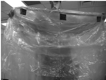
Step 5: Prepare Drape for Attachment