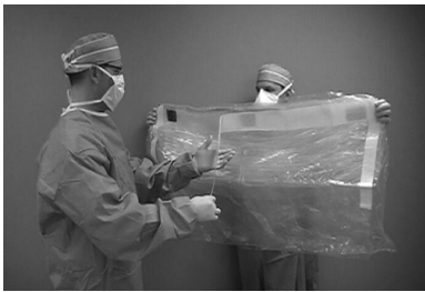
Step 4: Remove Adhesive Backing